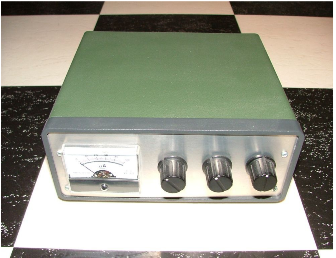
Frontside of the Artificial Ground device